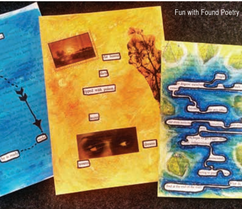
Fun with Found Poetry

Do you dream of being an artist? Or starring on Broadway? Start your journey here with an inspiring class.